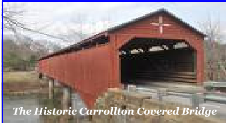
The Historic Carrollton Covered Bridge